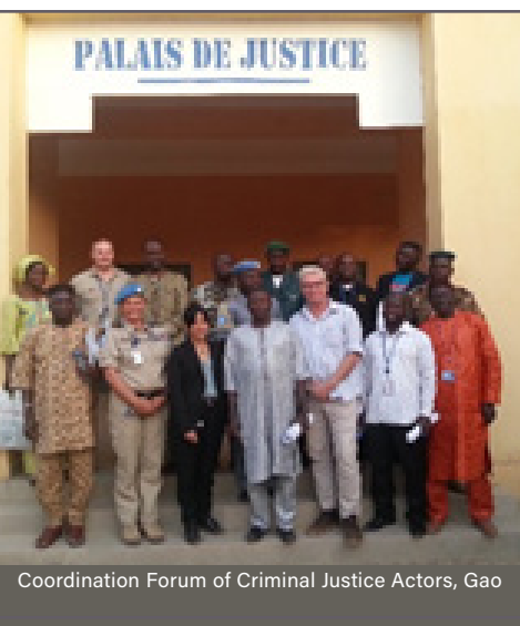
Coordination Forum of Criminal Justice Actors, Gao

authorities) to identify and address blockages in the processing of specific case files as well as to consider more systemic issues and institutional needs.