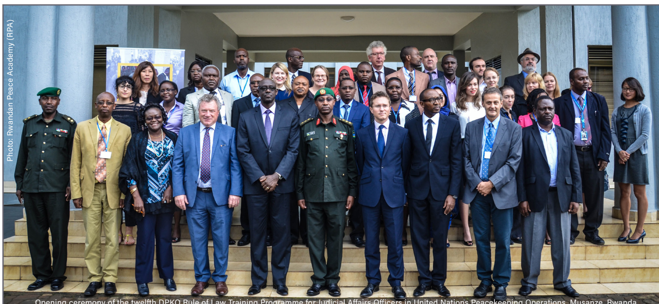
Opening ceremony of the twelfth DPKO Rule of Law Training Programme for Judicial Affairs Officers in United Nations Peacekeeping Operations, Musanze, Rwanda