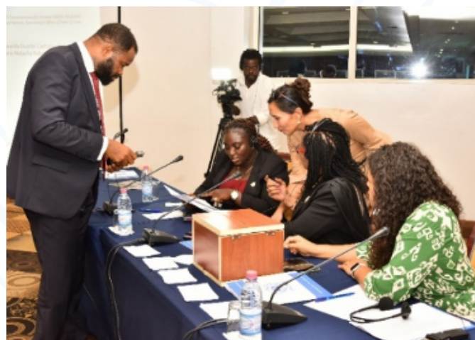
JCSC Judicial Affairs Officer (third from right) attends the 2024 WABA Conference in Benin.