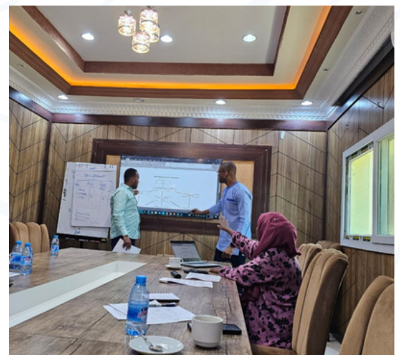
Working session on the Corrections Model at the Ministry of Justice & Constitutional Affairs (MOJCA) in Mogadishu, Somalia. From left to right: MOJCA Director of Corrections and JCSC Corrections Officer (standing) and MOJCA Director of Planning (sitting).

Between January and March, a JCSC Corrections Officer temporarily assumed the role of Chief Corrections Officer to prevent critical gaps and ensure continuity, especially regarding the finalization of the corrections model within the framework of the constitutional reform process in Somalia. The deployment resulted in a concept note on demilitarizing the Custodial Corps and implementation of the Federal Corrections Model, which was adopted by the Federal Government, as well as a joint review of the Prison Law, in collaboration with UNODC.