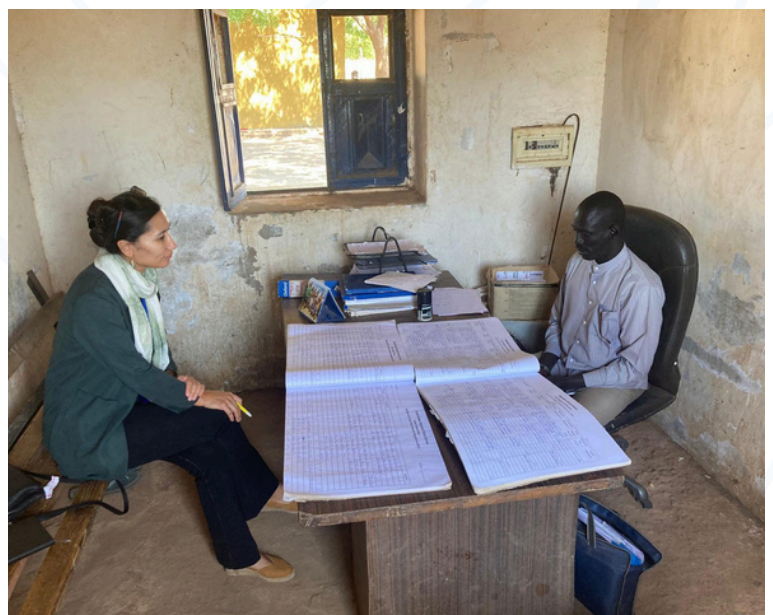
JCSC Judicial Affairs Officer with the State Police Investigator in Bentiu, Unity State, South Sudan.

Between October and December, a JCSC Judicial Affairs Officer supported UNMISS on a Norway-funded project focusing on advancing accountability for sexual and gender-based violence and conflict-related sexual violence in hot spots of South Sudan. Based on a desk review and field consultations, the JCSC Officer assessed progress, advised on monitoring, evaluation and planning and prepared an impact report summarizing results, key challenges and next steps. This report will also serve as an advocacy and resource mobilization tool.